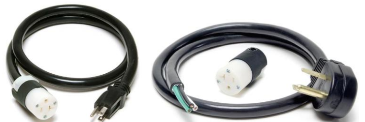
15A Plug to 20A Receptacle, 4 ft.