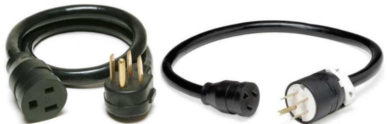
S21 Plug to 1252 Receptacle, 4 ft. 9451C Plug to 1252 Receptacle, 3 ft.