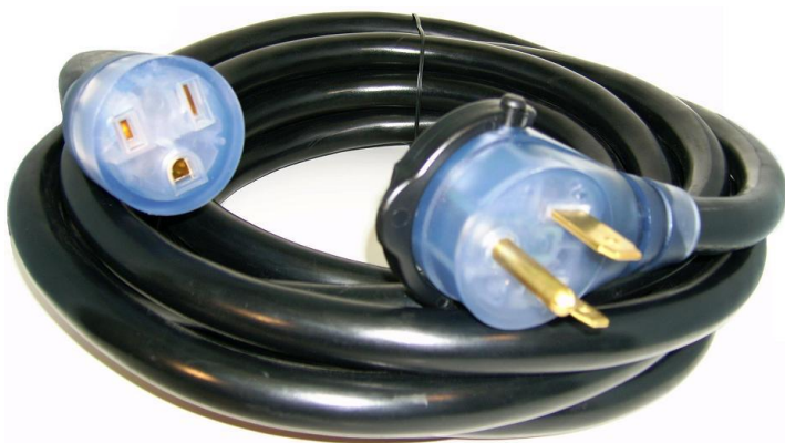
8/3 Heavy Duty Lighted Welding Machine Cords: 25 and 50 ft. Lengths (6-50P to 6-50R)